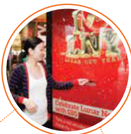
Adshel & SBS ethnic audiences targeting initiative