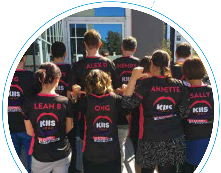
ARN employees teaming up for charity

APN is supportive of giving employees opportunities to participate in community initiatives. At Adshel, all permanent employees have $250 per annum to donate to a charity of their choice. Employees also have the option to pool their donations and direct the pooled funds to a chosen charity. An initiative that continued into 2016 saw Adshel employees provided with one day off to volunteer for a charity of their choice. The initiative allows permanent employees to undertake charitable work in their local communities, either individually or by teaming up with other Adshel colleagues.