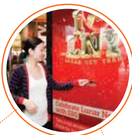
Adshel & SBS ethnic audiences targeting initiative