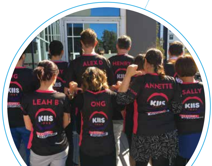
ARN employees teaming up for charity

APN is supportive of giving employees opportunities to participate in community initiatives. At Adshel, all permanent employees have $250 per annum to donate to a charity of their choice. Employees also have the option to pool their donations and direct the pooled funds to a chosen charity. An initiative that continued into 2016 saw Adshel employees provided with one day off to volunteer for a charity of their choice. The initiative allows permanent employees to undertake charitable work in their local communities, either individually or by teaming up with other Adshel colleagues.