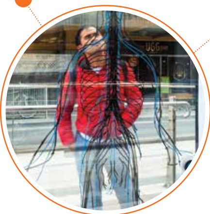
Adshel special build for University of Melbourne campaign

Adshel will continue to invest in its automated sales platform, enabling media buyers to purchase Adshel with the same efficiency and calculation they have been achieving with online advertising.